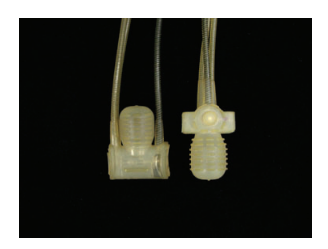
Figure 1 Tactile pump (on left) and new Momentary Squeeze pump.

Cylinder changes were designed to make implantation for the physician easier. Dilatation to only 11 Hegar was necessary to implant the base, whereas previous standard cylinder bases required dilatation to 12 Hegar. The new narrower base of the standard sized cylinder was within 1 mm of the downsized CXR prosthesis from AMS. This nar-