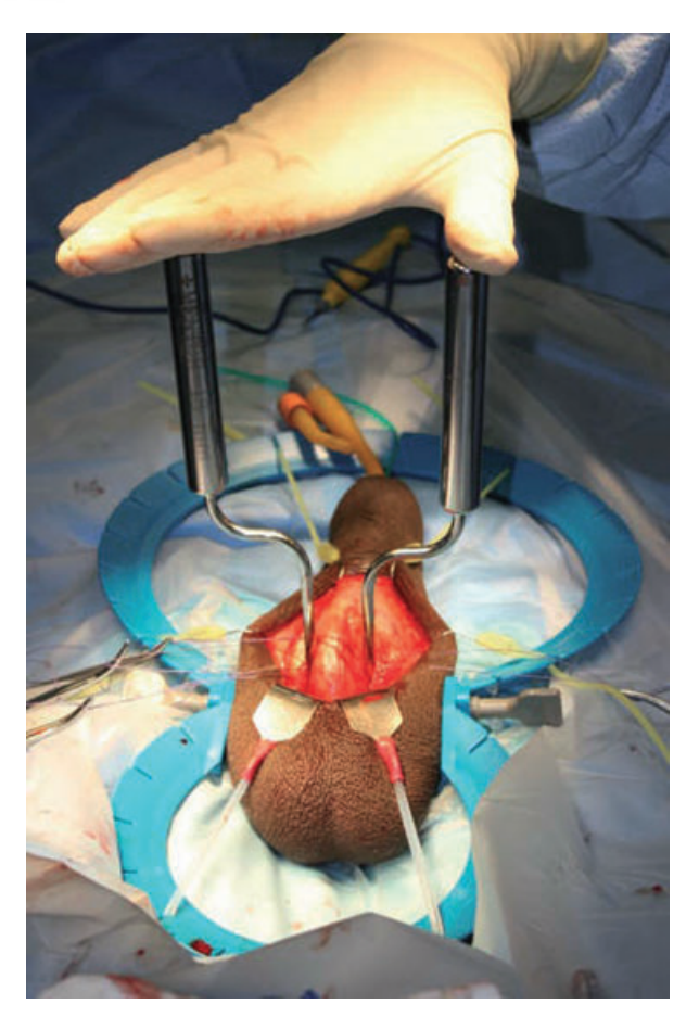
Figure 1 Field goal test: dilators at same depth and angle.

implant will not work again; (ii) revision surgery, where the surgeon tries to diagnose the failed component of the IPP and corrects just that one aspect of the IPP; or (iii) complete replacement, with an entirely new IPP. The patient was educated that most experts suggest that after 5 years the entire implant be replaced; the patient elected for replacement with a new IPP.